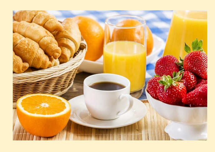
Sorry, kids. Coffee will be for grown-ups only!